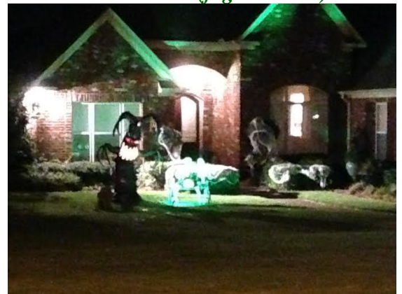
603 Overlook, Honorable Mention