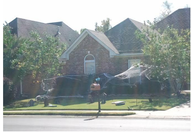
139 Eastside Drive (fog machine) TIE