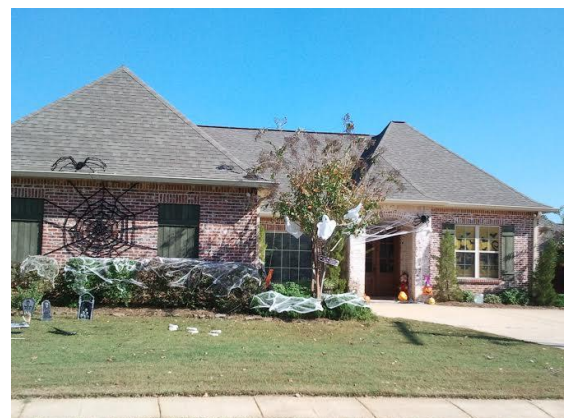
164 Eastside Drive, Honorable Mention