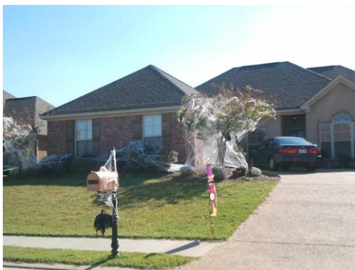
516 Springhill Crossing – 3 rd Place